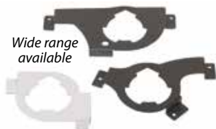
Wide range available