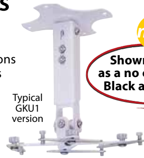
Typical GKU1 version