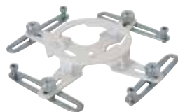
EU Registered Design 00221072-0001