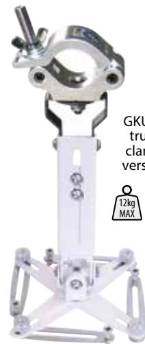
GKUT1 truss clamp version