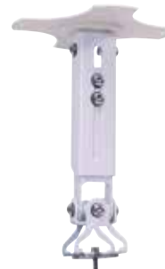
GK0 camera screw version