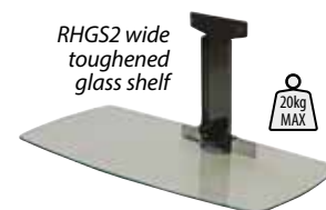
RHGS2 wide toughened glass shelf