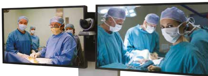
Rhobus RH200 Trolley in non-standard RAL 7035 light grey with twin screens, blade camera mount & centre infill panel